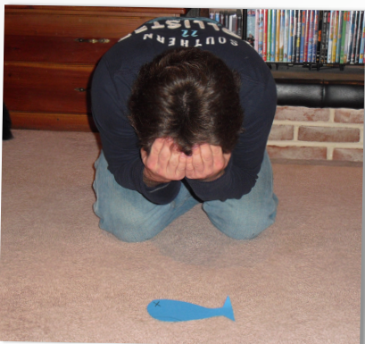
A RECENT PHOTO OF VARDAMAN AND THE DEAD FISH.